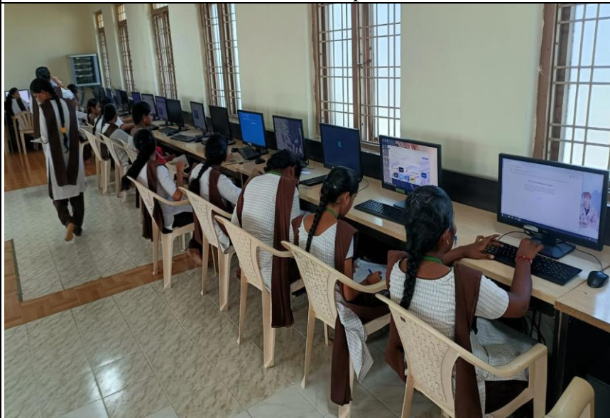
Advanced computer graphics